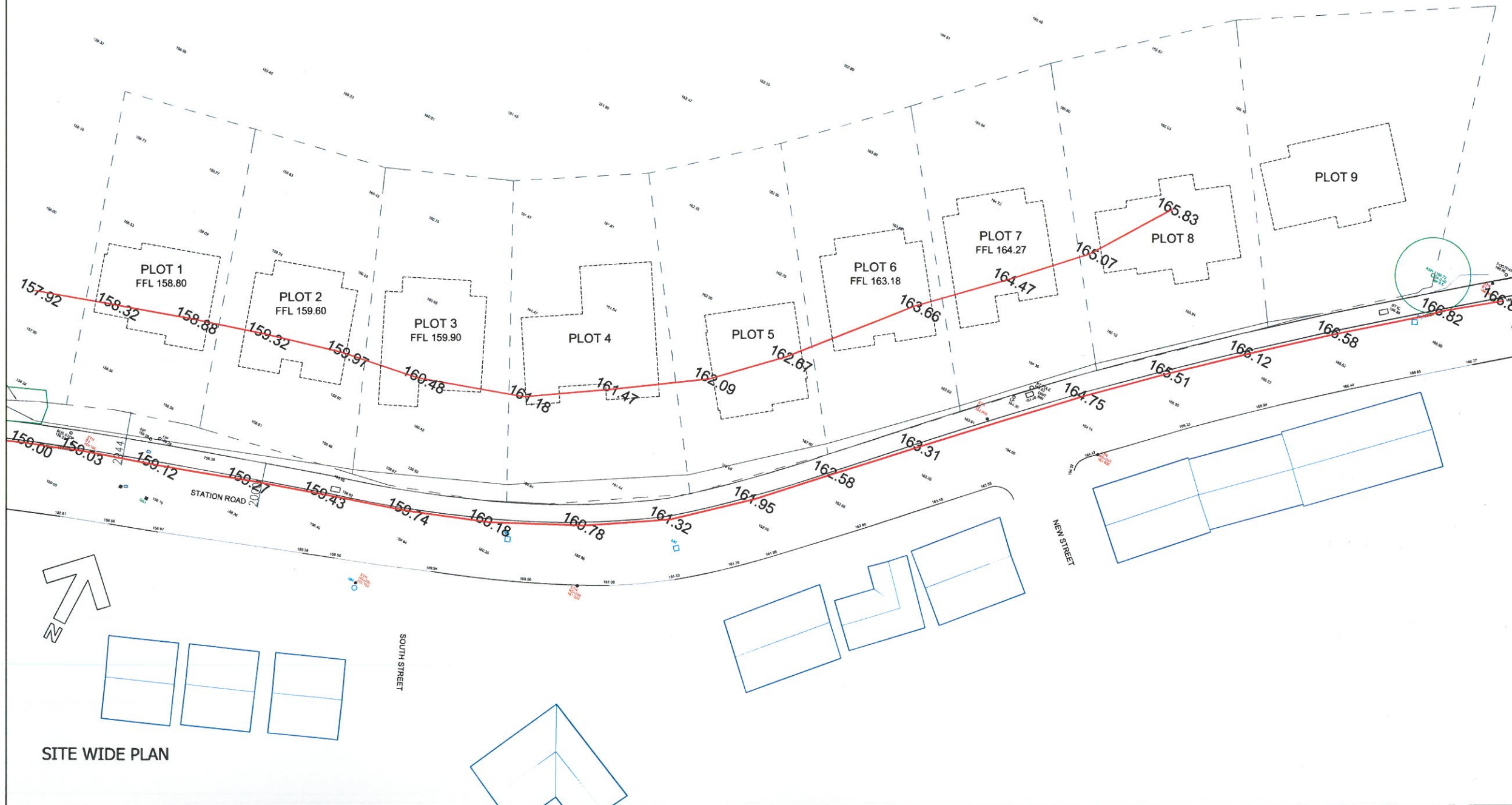
SITE WIDE PLAN